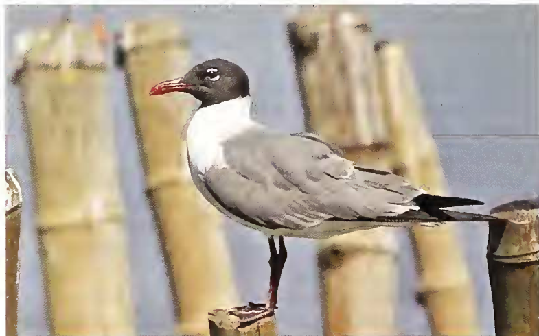
Plate 8. Laughing Gull Leucophaeus atricilla , Balanga, Bataan, Luzon, 4 February 2013.